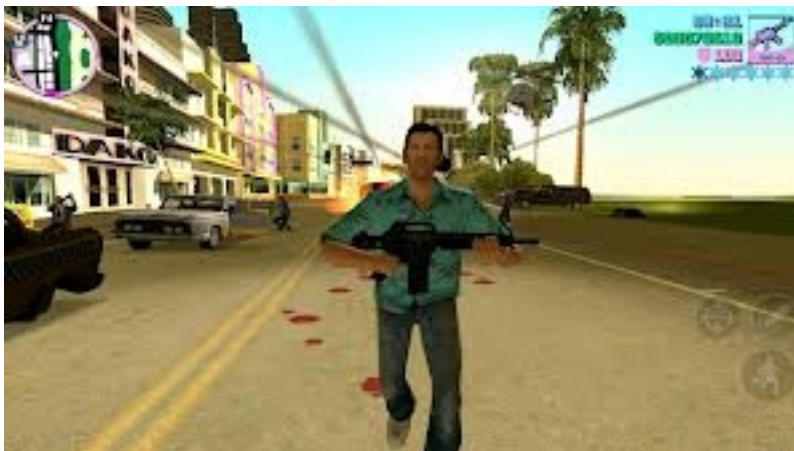
Grand Theft Auto: Vice City contains significant graphic detail.

Edge is a brightly colored puzzle game that depends on finger dexterity and ability to figure out puzzle paths. The player moves a soft-edged cube through geometric puzzle lanes. Successful completion of one puzzle brings you to the next of 48 total levels. It is forgiving, providing second chances and often giving subtle hints. Touch-screen sensitivity allows the player to press harder to move a cube up and over obstacles. It is highly intuitive, and works well in the puzzle-game mode of frequently starting over.